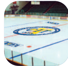
Refrigeration and Ice