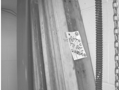
Figure 5.0 - Tagged Blades