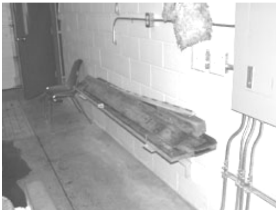
Figure 6.0 - Stored Blades

Each new blade and the blade holder arrive at the facility in a “mirror finish condition”. You will not see an actual reflection when looking at these items. The mirror finish will provide a visual imprint of what the condition of these two surfaces should be; smooth with no rust or “pitting” of the metal surfaces. It is the ice resurfacer operator’s responsibility to maintain