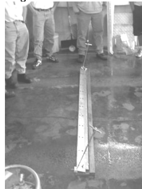
Figure 3.0 - Blade with Blade Hooks in Place